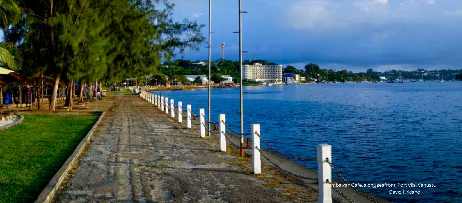
Mambawan Cafe, along seafont, Port Vila, Vanuatu